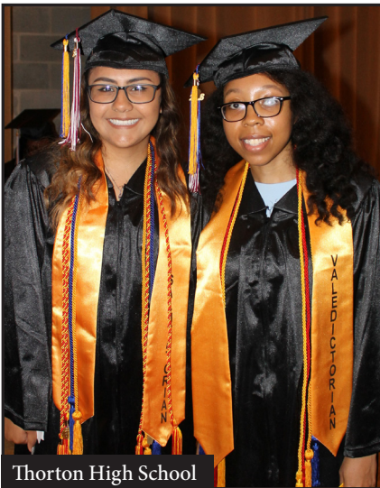
Thorton High School