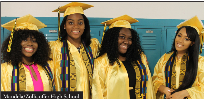
Mandela/Zollicoffer High School