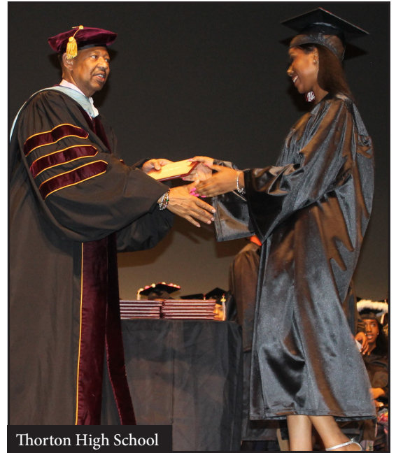
Thorton High School