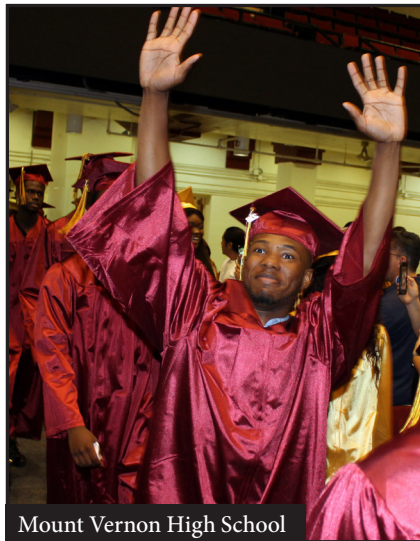
Mount Vernon High School