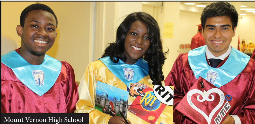
Mount Vernon High School